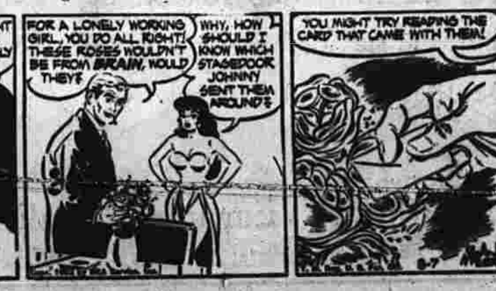
Poor Working Girl