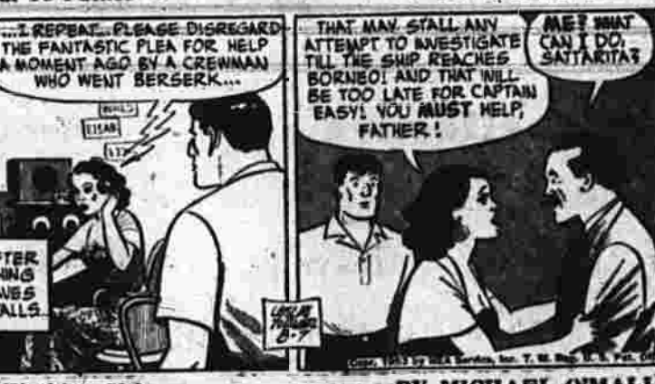
Appeal To Father