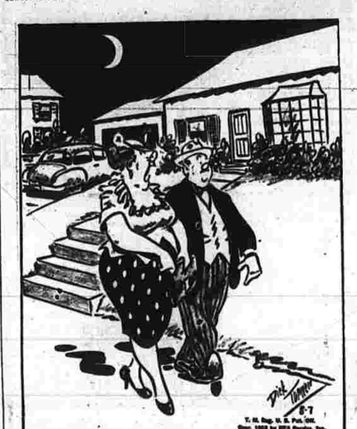
BY DICK TURNER