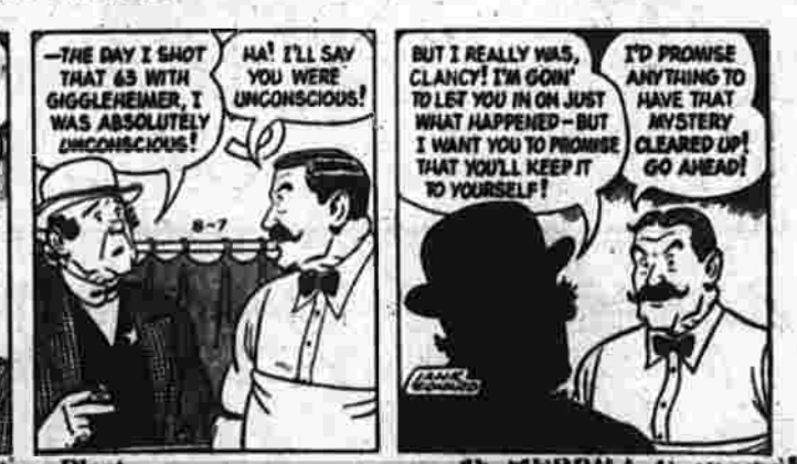
BY LANK LEONARD