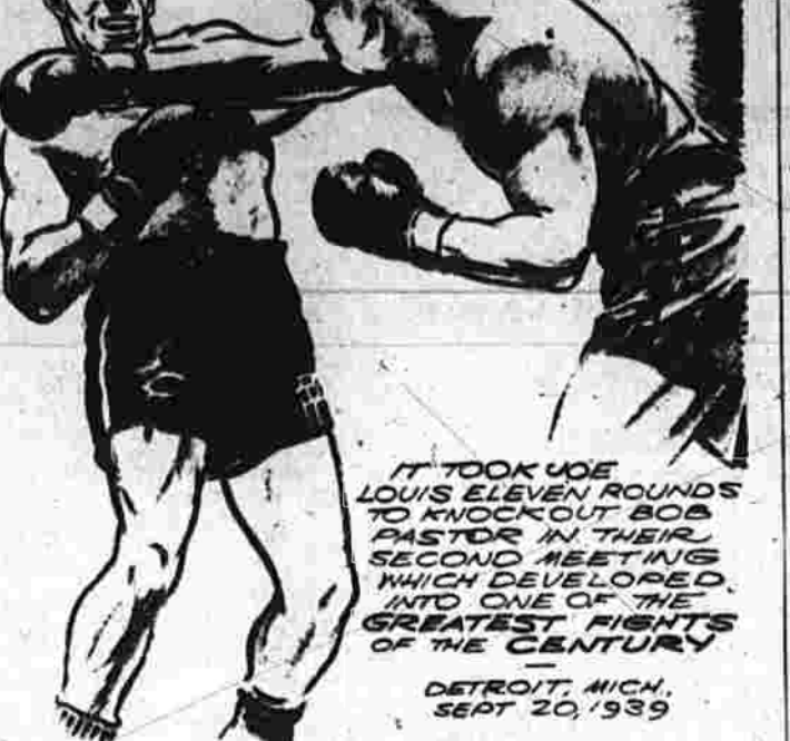
IT LOOKS LIKE LOUIS' BOXING BOSS IS GOING TO WICKOCK UP BOB FIGHTING INTO ONE OF THE GREATEST FIGHTS OF THE CENTURY. DETROIT, MICH., SEPT. 20, 1939