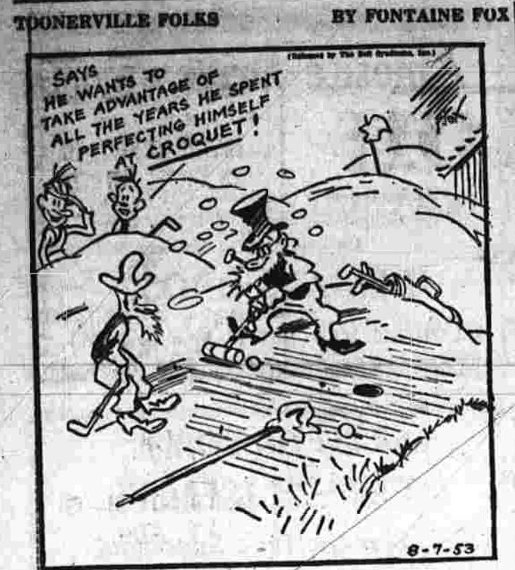
BY FONTAINE FOX