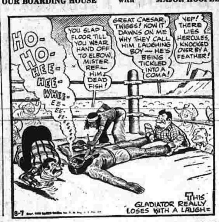
with MAJOR HOOPLE