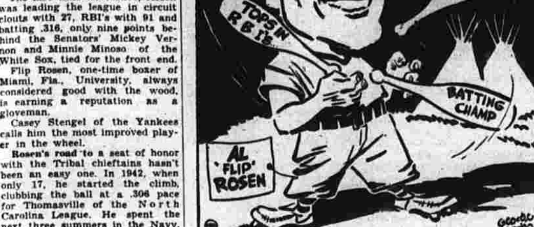
WOODEN INDIANS FOLD WIGWAM, SLIP OUT OF ANOTHER RACE

By TOM PROBY Special Correspondent Cleveland—(NEA)—All of the Indians are beating their drums in a grand effort to get the New York Yankees to fold their fifth straight American League pennant.