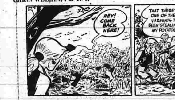
A Beaten Man